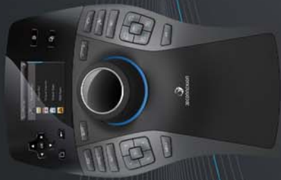
SpacePilot® PRO The Ultimate Professional 3D Mouse

SpacePilot PRO is the ultimate professional 3D mouse, engineered to excel in today's most demanding 3D software environments.