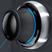
SpaceNavigator™ 3D Mouse

SpaceNavigator for Notebooks is two thirds the size and half the weight of its desktop counterpart. Its convenient protective travel case makes it ideal for mobile 3D users.