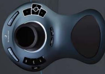
SpaceExplorer™ Professional 3D Mouse

** The SpacePilot PRO Model Properties applet is currently available for SolidWorks, AutoCAD, Inventor, Siemens NX, Siemens Solid Edge, PTC Pro/ENGINEER.