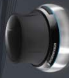
SpaceNavigator™ for Notebooks Portable 3D Mouse

With SpaceNavigator™ or SpaceNavigator™ for Notebooks, everyone can enjoy the freedom of professional 3D navigation, at home, at work or on the road.