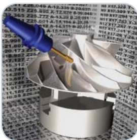
Impeller machining with Pro/ENGINEER

With Pro/ENGINEER Complete Machining, manufacturing engineers can work concurrently with designers to automatically incorporate design changes. With this integrated collaboration between two fundamental areas of development, you have the power to increase product quality, reduce scrap and shave production time and costs.