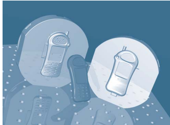
Automatic Core/Cavity creation